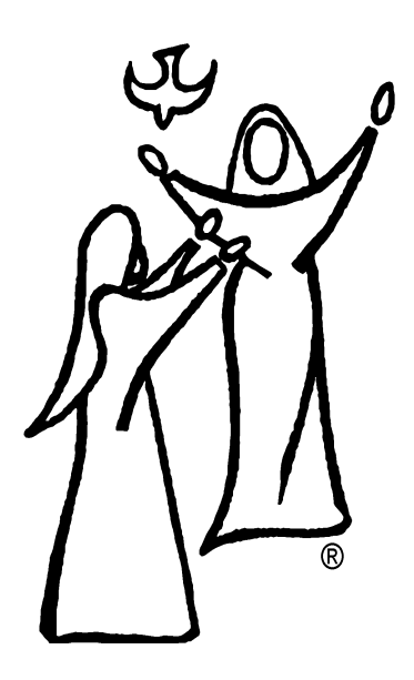
A Ministry to Catholic Women

Rochester Chapter Spouse of the Holy Spirit